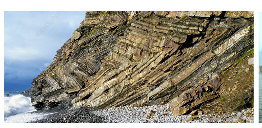
Parallel strata - unmistakeable proof of Noah's Flood

It is commonly said that Judgment Day we shall "meet our Maker". It was Christ Himself near-black - indeed, there have been oil wells who made us! "Know ye that the LORD he is at Kimmeridge. Wherever you see lines of par-God: it is he that hath made us, and not we allel strata, whether in the Grand Canyon, Kim-