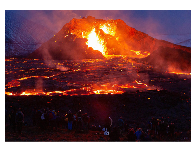
Iceland: Orange jets of lava flame high into the night sky

tion by far in recent centuries was on the island of Krakatoa in August 1883. The energy released from the explosion was around 200 megatons of TNT, with a force roughly four times as great as the most powerful thermonuclear weapon ever detonated. It spewed out so much dust into the atmosphere that the warmth of the sun was hindered - to the extent that world temperatures dropped by about 1°F (0.6°F) over the following months.