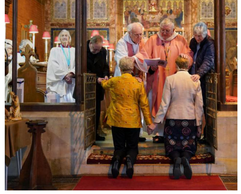
The union of two lesbian priests is blessed under the LBGT flag by Rev Andrew Dotchin

The House of Bishops had five days earlier (12 December), in an historic decision made in a Zoom meeting, agreed to approve prayers for the blessings of same-sex unions in regular public worship, such as Sunday Eucharist or Evensong, by 24 votes to 11, with three Bishops abstaining. The decision took effect at midnight on 16/17 December, just in time for this first-ever CofE blessing of a same-sex union. The large new LGBT flag, with its chevrons in the new transgender colours of white, pink and blue, fluttered boldly above the ceremony.