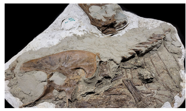
The fossilised remains of a young dinosaur, and its last two meals, discovered in Canada

There was evidence of bite marks on the bones of one of the creatures in the tyrannosaurus's stomach. The team says the young tyrannosaur weighed nearly half a ton and determined its age by growth rings in its fossilised bones. Its conclusions