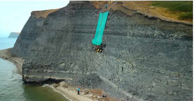
Suspended by ropes 50 feet above a rocky beach, a team of palaeontologists work to remove the skull of a pliosaur, buried during Noah's Flood

The 130 Icelandic volcanoes lie across the 'Mid-Atlantic-Ridge'. Scripture tells us (Genesis 1:1) that on the Third Day of Creation, "God said. Let the waters under the heaven be gathered together unto one place, and let the dry land appear: and it was so." Some believe this his peak. Peleg could I have been born around means there was originally only one landmass on the earth – which, as it happens agrees with the geologists, who call this single, large mass